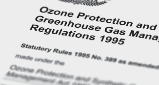
Table 322 licences and entitlements (from the Ozone Protection and Synthetic Greenhouse Gas Management Regulations 1995)